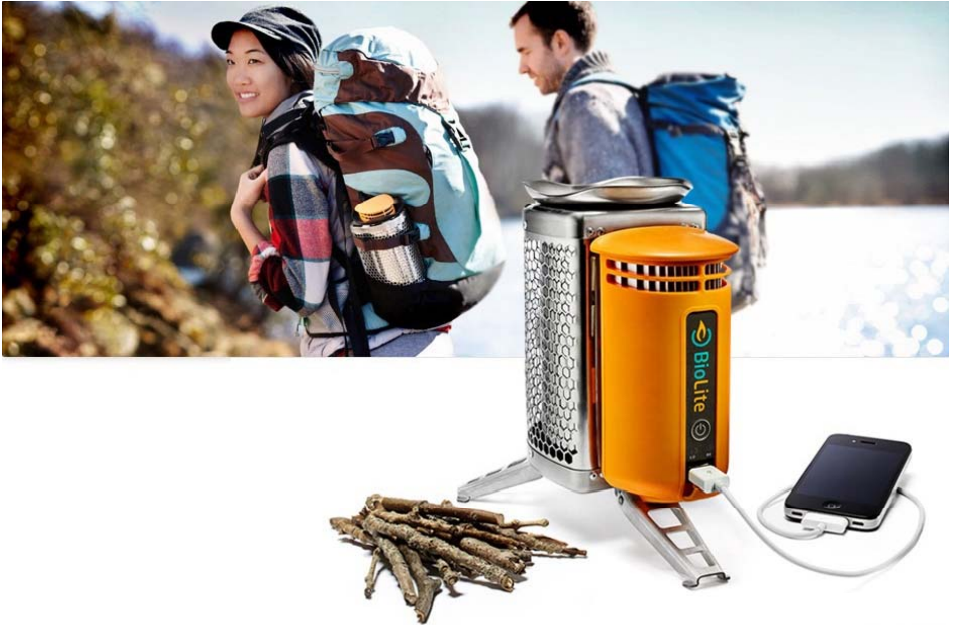
the BioLite CampStove